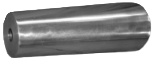
STEERING POST - 10" Catalog No. 18802 Item No. 381