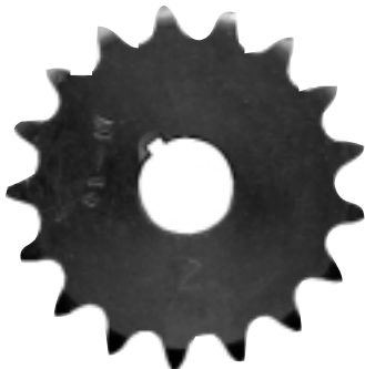
SPROCKET 17 TOOTH