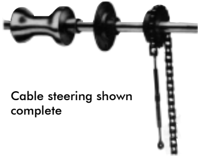
Cable steering shown complete