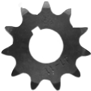
SPROCKET 11 TOOTH