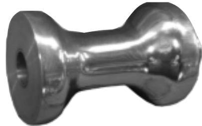
STEERING POST - 4" Catalog No. 18804 Item No. 382