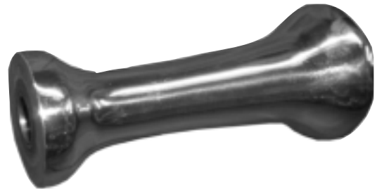
STEERING POST - 6 3 / 4 " Catalog No. 18806 Item No. 384